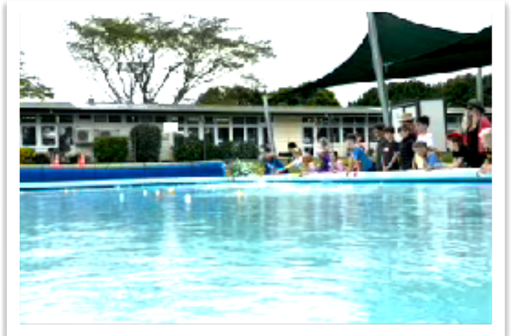
The pool is open!