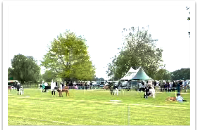
Calves being judged for Ag Day

days a week situation. Labour day in New Zealand was brought into being in 1890 to originally celebrate the award of the 8 hour working day in 1840 to Wellington carpenter, Samuel Parnell, and was marked with union organised parades and marches where workers were allowed the day, or at least part of it, off to attend.