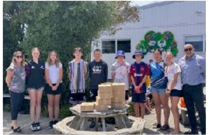
Student Council at Puketaha School

coveted slots in the inter school competitions. Running, high jump, shot put, discus and long jump are all competed in with house points also being awarded toward the annual house competition.