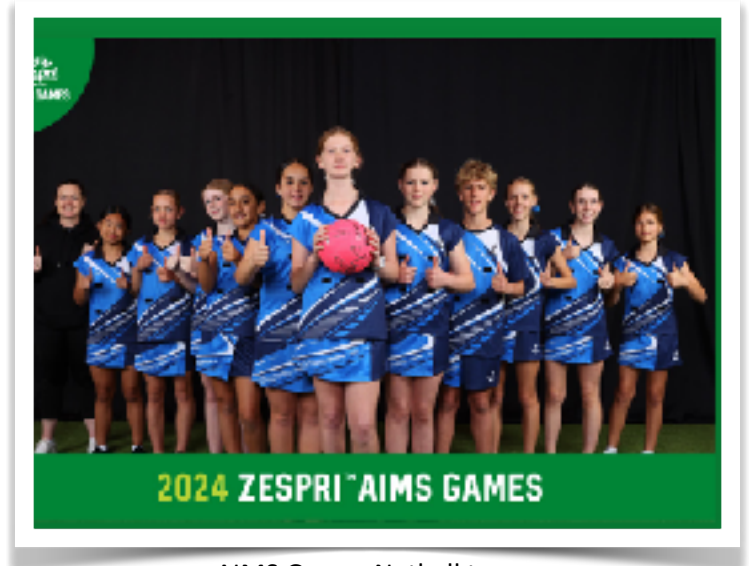
AIMS Games Netball team

On Friday 25th October, school will be closed for a Teacher only day. This is the final accord day awarded when the teachers finalised their collective agreement. This day is also a teacher only day for our Te Pae Here partner schools in our Kahui Ako. School will be closed for instruction so please make alternative arrangements for your children for that day.